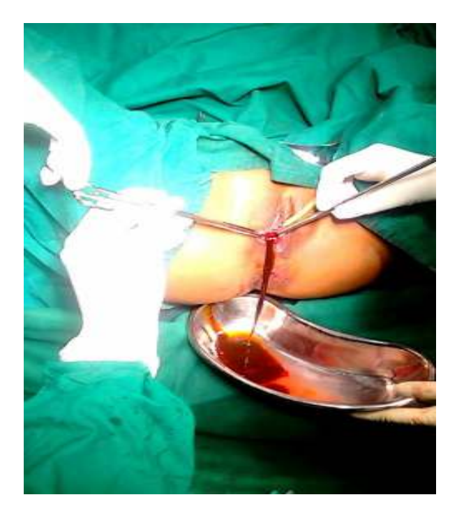
Figure 4: Drainage of hematocolpos of blind hemivagina