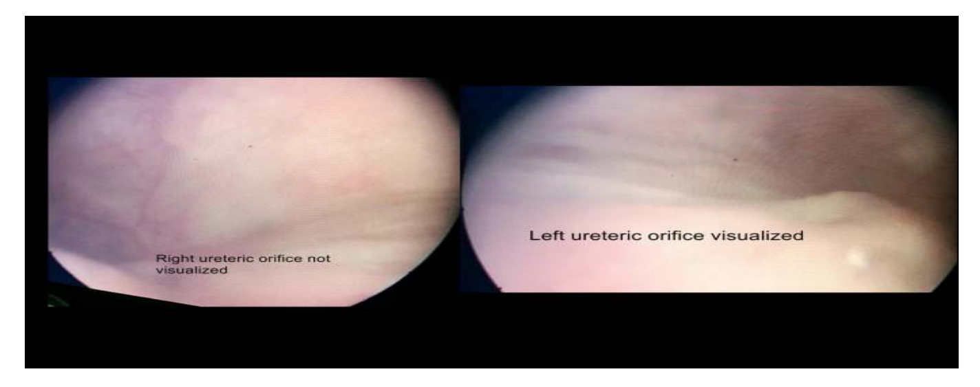
Figure 3: Cystoscopy. showing right ureteric orifice