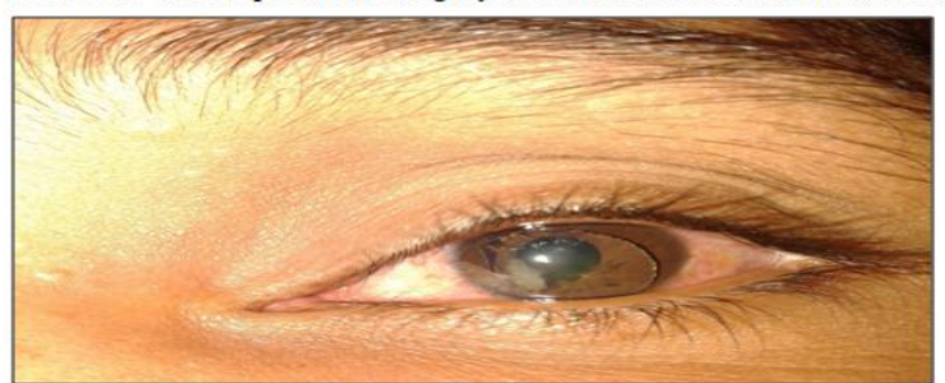
FIGURE 2: Clinical picture showing crystalline lens dislocated in Anterior chamber