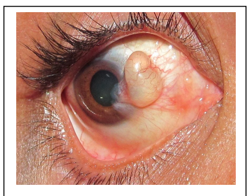
Fig.1 : Clinical photograph showing cystic swelling in the body of pterygeum