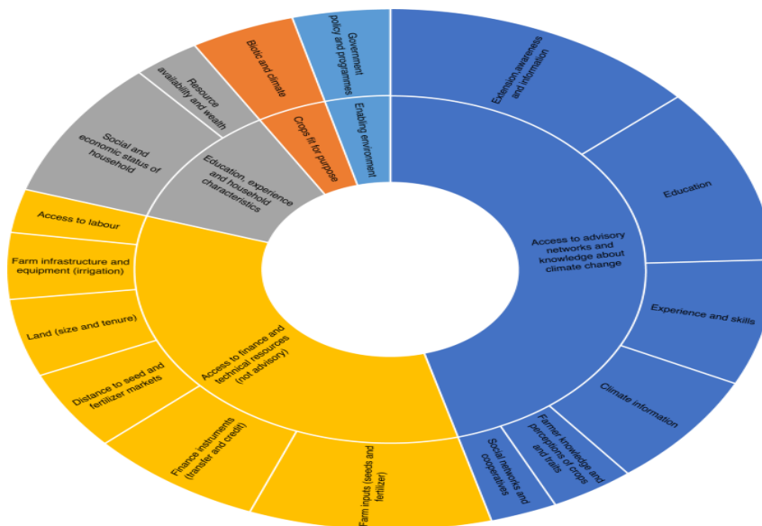
Fig. 1: Summary of determinants of adoption of climate-resilient crops and crop varieties by farmers

The inner ring outlines the five broad categories to which the 29 social and economic factors are mapped. The outer ring shows the factors within each broad category that were most frequently mentioned across the included studies. The relative area occupied by categories indicates their relevance.